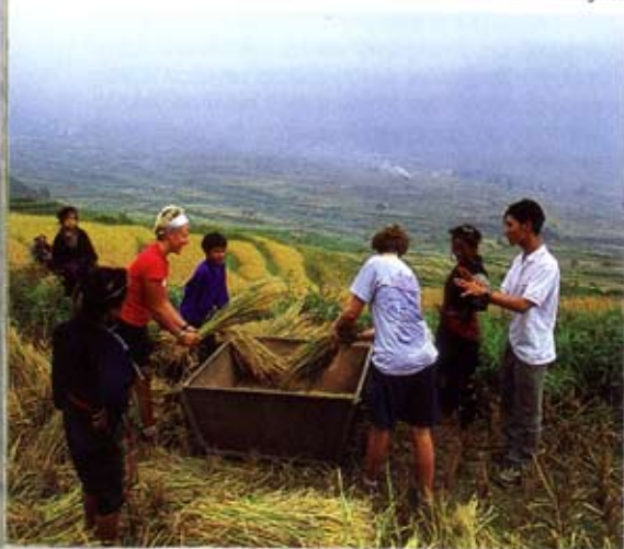
Visitors threshing rice

Pacific Discovery tours are personalized, interpretive and educational using the philosophy of experiential education – where learning is hands-on and tangible. They have developed meaningful connections with people and places visited which is reflected in the quality of experiences they are able to offer. The company's strong relationships developed over many years working with local communities and NGOs ensure a rewarding and inspiring experience for participants.